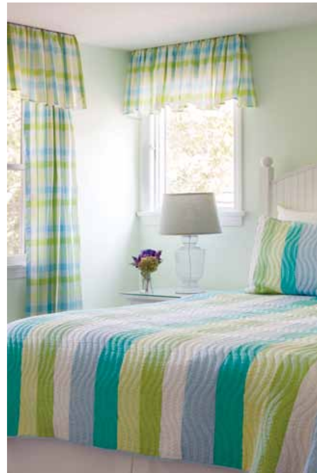
The homeowners' daughters each selected the palettes for their bedrooms; one opted for punches of bright pink, the other a seaside color scheme.

Combined, all of her customizations add up to an interior that is welcoming and personable, with furnished rooms that function to their fullest potential. "It was challenging to measure and envision spaces during all of the construction," recalls Malone, "but in the end everything came together and is now enjoyed as an artistic whole." ▲