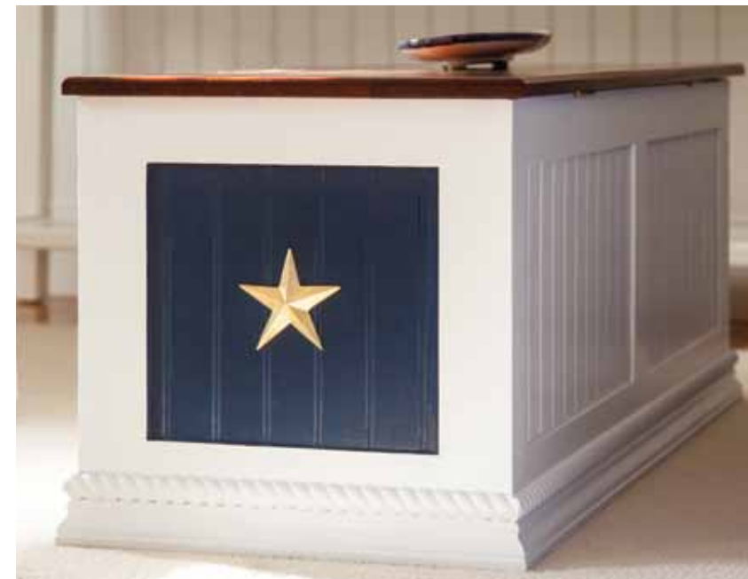
Above: The family room, a frequent gathering spot, is filled with brightly-colored upholstered pieces and nautical touches.

A fortuitous first meeting “They came into Seaport Shutter looking for shutters and mahogany screen doors and discovered Nautique, the side of our business that provides interior design services and custom furniture,” recalls Malone. “They needed almost everything for their new house and one thing led to another. In the end, I designed just about all of the furnishings and window treatments, picking the fabrics and overseeing any custom upholstery.” Nautique’s in-house craftspeople handled all of the fabrication and hand-painting.