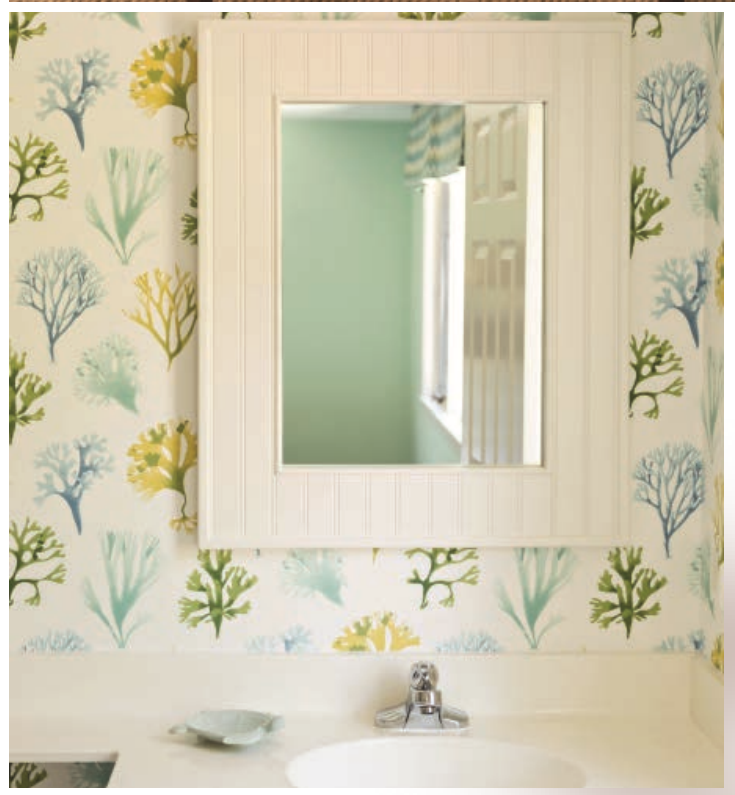
Top left: The circular game table is a Nautique Vintage piece that is well-used in this family-friendly home. Top middle: Navy blue and red accents make an appearance in the upstairs billiard room. Above: A soft blue-and-green kelp design wall covering creates a soothing mood in the guest bathroom.

38 ANNUAL EDITION 2015-16 southernnehome.com