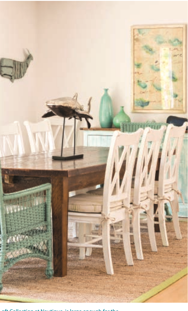
The dining table, from the Sail Loft Collection at Nautique, is large enough for the homeowner's extended family to gather around. Vintage bathing beauty decor adds a whimsical note to this vacation home.

Its fun and relaxed look is exactly what the homeowners wanted for their entire house. They live year-round in Dallas but have longstanding ties to the Cape, and the kids' grandparents live just a mile away. The couple wanted this vacation home to be a gathering place for all the cousins, nephews and nieces, so they needed a family-friendly space that also felt restful.