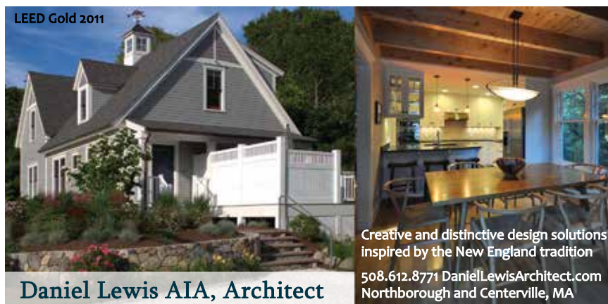
LEED Gold 2011

84 Homers Dock Rd, Yarmouth Port | apkimballconstruction.com | 508.737.1258